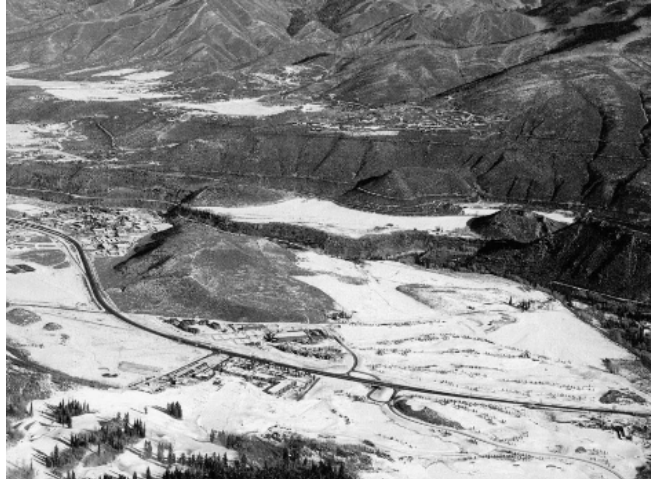
Regional Site Photo

Burlingame Ranch Affordable Housing has been carefully designed to create a livable, sustainable and economically viable community consistent with the historic character of the land. The site is located in the heart of historic ranch land that once dominated the Roaring Fork Valley. It is the intent of these design guidelines to ensure the ranch vernacular aesthetic is maintained, as well as encourage the use of green technologies and green building practices throughout the site.