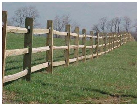
3 Rail Corral Fence

In order to preserve the continuous neighborhood character, no fences, gates or free standing walls will be permitted along the front of the property. Privacy fences are not permitted as they diminish the sense of community and impede wildlife movement. Alternatives to privacy fences include planting screens. Side and rear yard perimeter fences are permitted, however they will be limited to "open" two or three wood rail corral fence or similar in character approved by the DRC. No fences shall exceed 42" in height. All fences shall meet Colorado Department of Wildlife