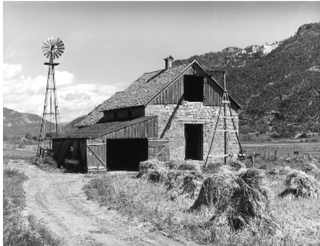
Ranch Vernacular Aesthetic

The architectural and landscape character of each lot are crucial components to maintaining a Ranch Vernacular aesthetic. Historic ranch architecture combines simple, well proportioned building forms to create functional living spaces. The existing natural landscape is dominated by sage and native grasses which is typical to drier climates. Site and landscape improvements are to respect the existing ranch character by utilizing site specific materials and native, xeric landscape plants. An understanding and respect for the natural resources of the site will ensure the Ranch Vernacular aesthetic is preserved and maintained throughout the site.